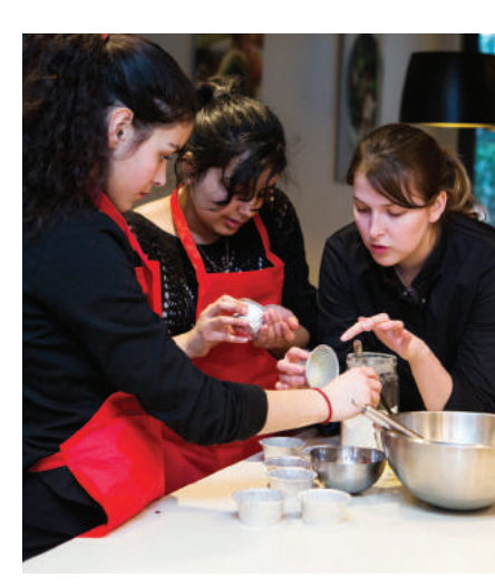
Prepare traditional French dishes on day 3