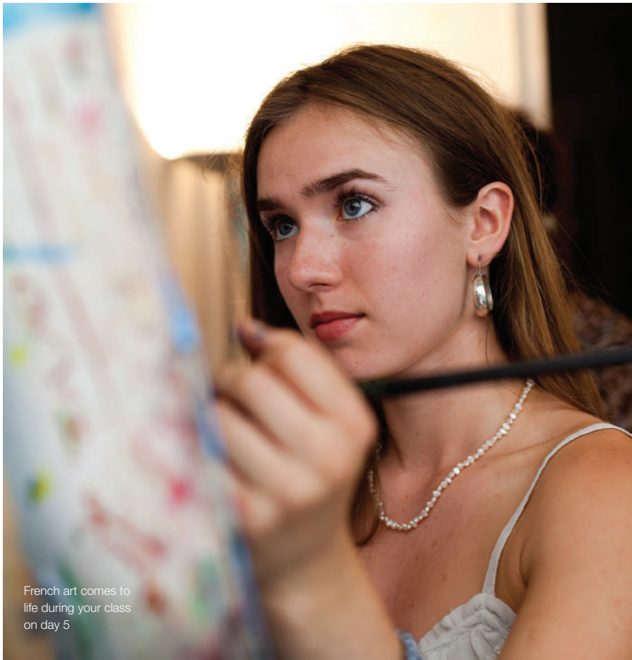
French art comes to life during your class on day 5