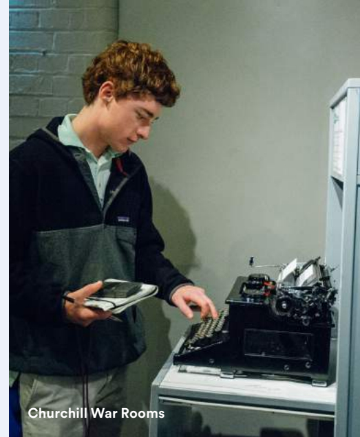
Churchill War Rooms